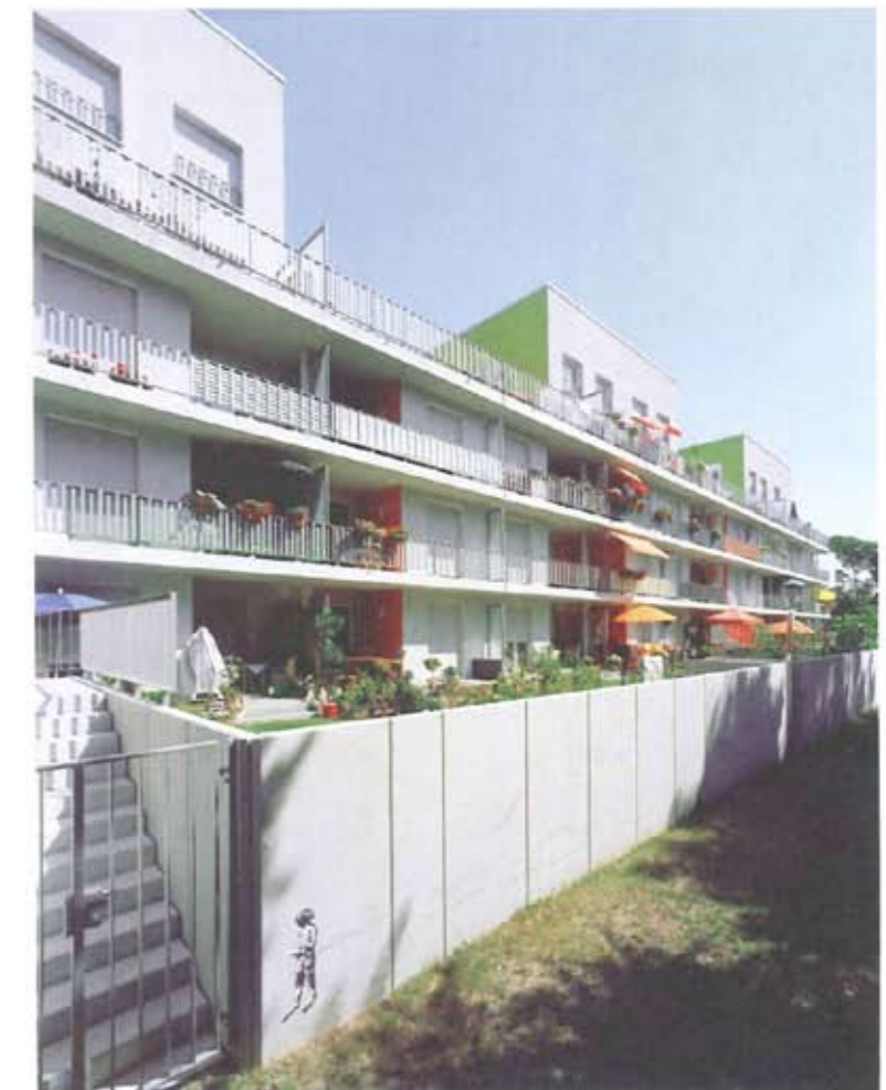
← Garden side with deep balconies and roof terraces